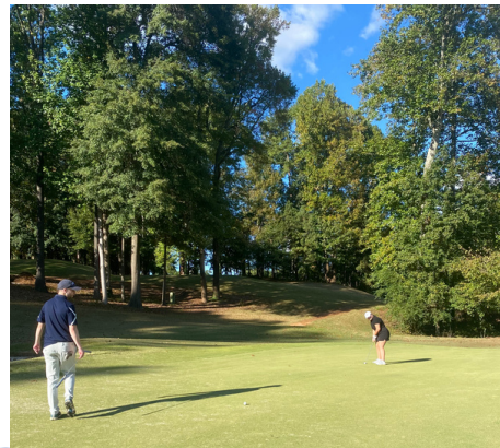
Golf lessons at East Lake

Aside from my classes, I am thoroughly enjoying immersing myself in the broader student culture. From going to Maggie's on Friday nights to endless hours spent in Kaldi's Depot, I am finally living that American experience that I yearned so much for as a child watching Disney Channel shows. Meeting new people has been exciting, but nothing compares to the feeling of seeing the old friends who have left an indelible mark on my heart. Thanks to the travel fund, I have been able to travel to New York, Boston, and DC to visit many of my friends from St Andrews who moved back to the US. This scholarship is providing me with a chance to keep my ties to St Andrews, while exploring new chances for my future. I have also had the chance to play a round of golf with my oldest friend from St Andrews, thanks to the helpful lessons between Emory and East Lake. In the future, I will hopefully be able to play an alumni game at the Old Course, too!