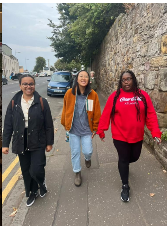
Right: Our first walk down the street, right after we got dropped off from the airport