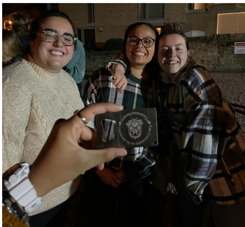
Left: Reeling practice with the Caledonian Society with Deans Court friends

Lastly, I have fallen in love with the stars in St Andrews. Growing up in cities, seeing stars was never a part of my daily life, so I am mesmerized by the sky every night in St Andrews. Before the end of term I hope to go stargazing in the Highlands.