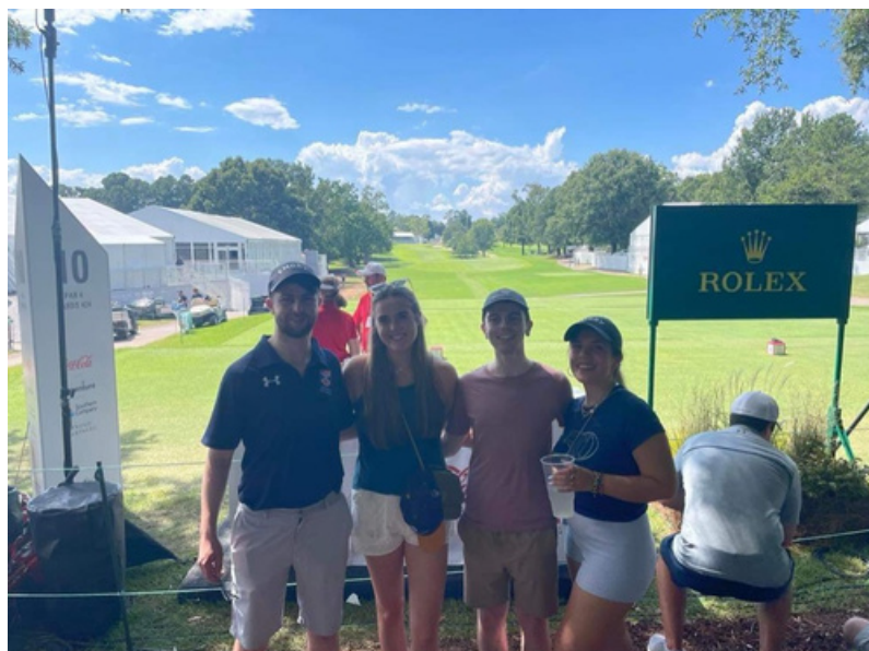
The 4 scholars at the Tour Championship