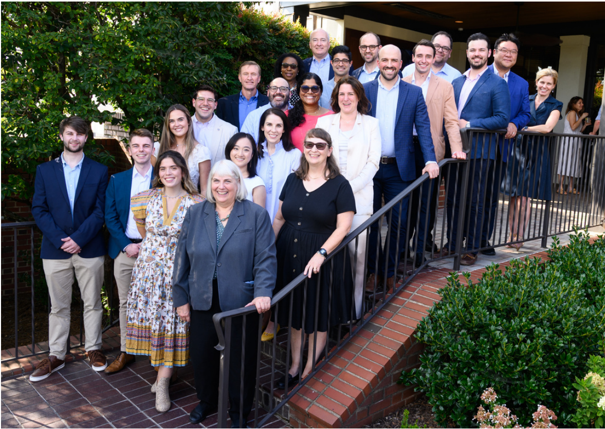
Bobby Jones Program Alumni